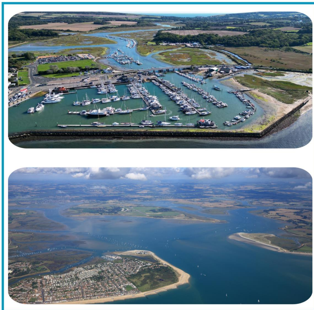
Top: Yarmouth. Bottom: Chichester Harbour

Full details of the business planning process can be found on the business plan section of the Forum’s website .