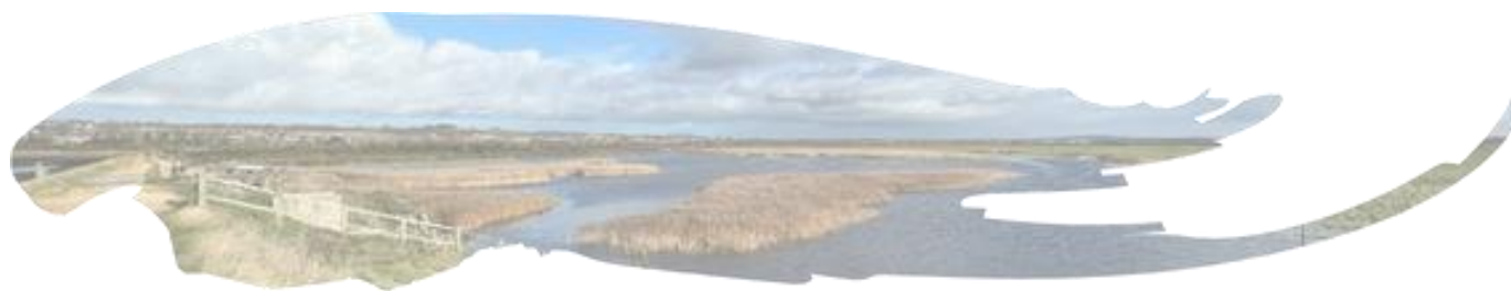
Titchfield Haven

Guiding principles for the Forum's involvement in external projects have been set out in this Plan. Project involvement will be reviewed annually against the staff resource available and published in the Annual Reports.