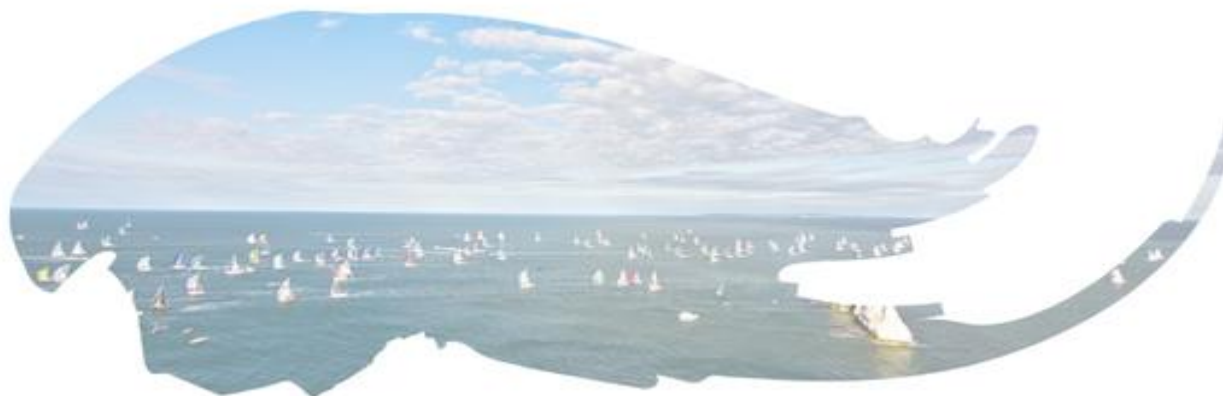
Round the Island Race

A large scale partnership project is proposed across the Solent that has been identified as a need by Solent Forum members. The Solent Forum agrees to project manage and charges a twenty percent management fee. Additional staff time is charged for deliverables and events that are outside of core project management.