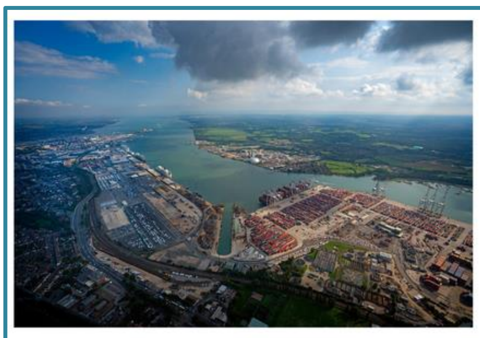
Southampton Water, © ABP Southampton