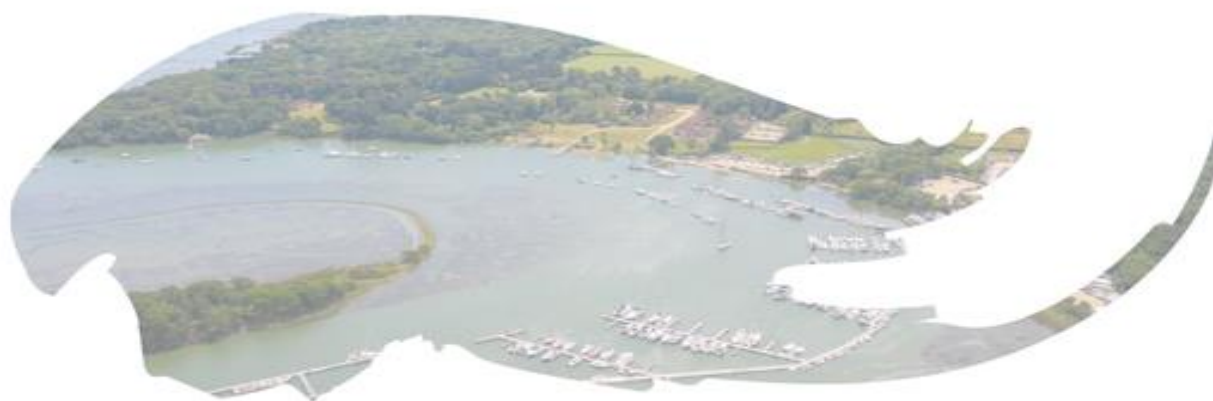
Beaulieu River

Horizon Scanning has highlighted that the Government's 25 Year Environment Plan will continue to shape national coastal and marine policy and that the review of the Environmental Improvement Plan will deliver ambitious targets to save nature, including those on water, circular economy and air quality as well as delivering against the target to halt the decline in species abundance by 2030.