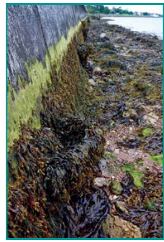
Boulder Array, three years after installation.

It will run for a period of three years, the project website can be viewed at: http://marineff-project.eu/en/marineff-2/.