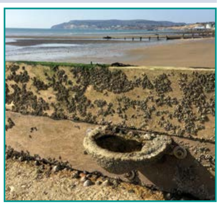
Vertipool at Sandown Bay

To help achieve these requirements, the Solent Forum worked with Solent partners to map and assess opportunities to enhance the ecology of Southampton Water's (including Itchen and Hamble estuaries) shoreline infrastructure. This included reviewing seawalls, tyres, jetties, concrete and wooden structures, wrecks, revetments, rip rap walls, moorings, pontoons and quay walls. A consultative exercise