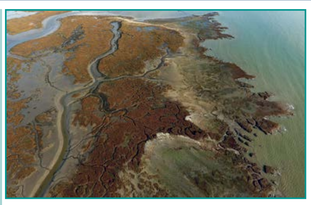
Lymington Marshes.