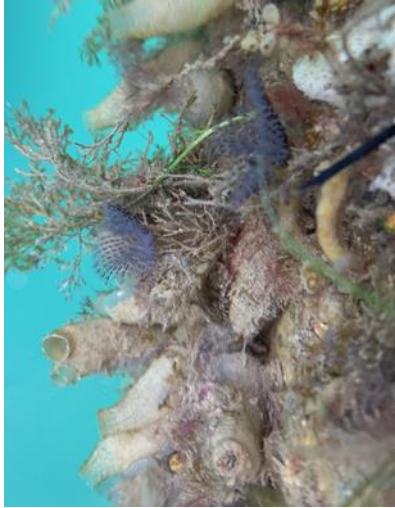
Sabellid Bispira polyomma