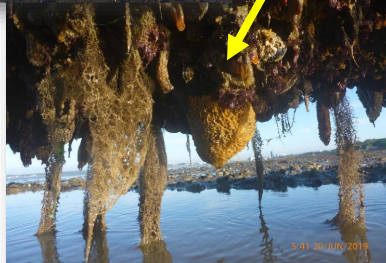
Man-made hard surfaces on shores